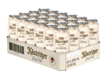
Köstritzer Pale Ale 24 x 0.5 l can tray