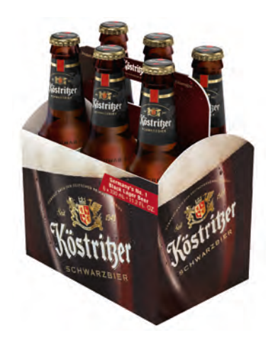
Köstritzer Schwarzbier 6 x 0.33 l bottle