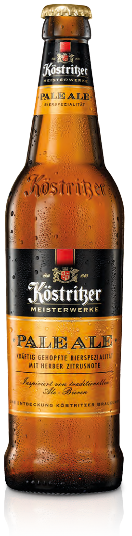
Köstritzer Meisterwerke Pale Ale 0.5 litre