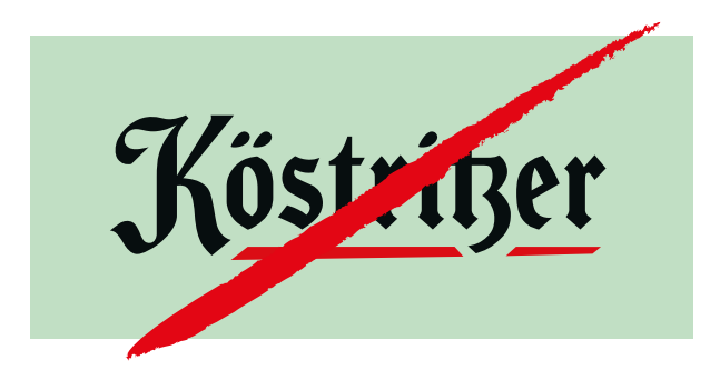
Positive logo text on a light background