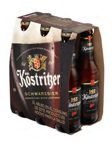
Köstritzer Schwarzbier 6 x 0.33 | bottle