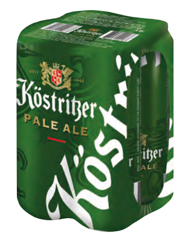
Köstritzer Pale Ale 4 x 0.5 l can