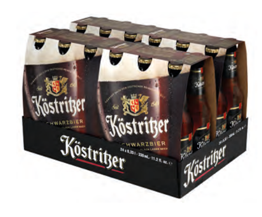
Köstritzer Schwarzbier 4 x 6 x 0.33 l bottle