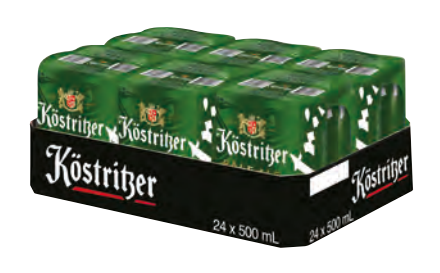
Köstritzer Pale Ale 6 x 4 x 0.5 l can