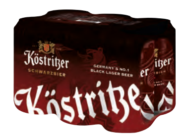
Köstritzer Schwarzbier 6 x 0.33 l can