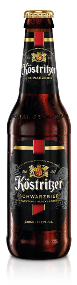
Köstritzer Schwarzbier 0.33 litre