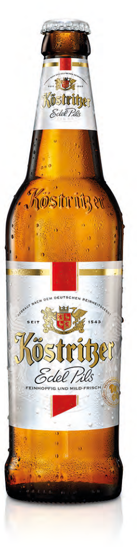
Köstritzer Edel Pils 0.5 litre