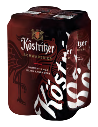
Köstritzer Schwarzbier 4 x 0.5 l can