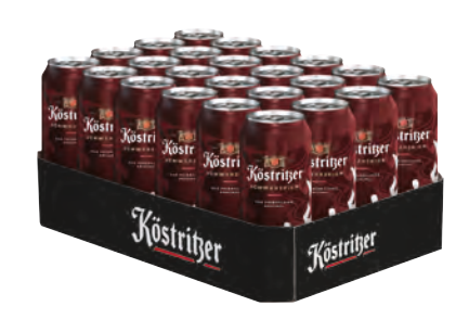
Köstritzer Schwarzbier 24 x 0.5 l can tray