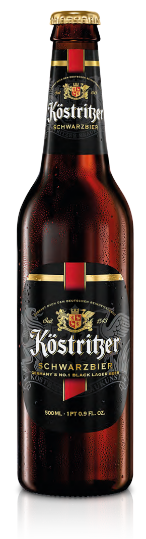
Köstritzer Schwarzbier 0.5 litre