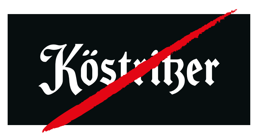
Logo text without red underline

On the right are examples that are inadmissible.