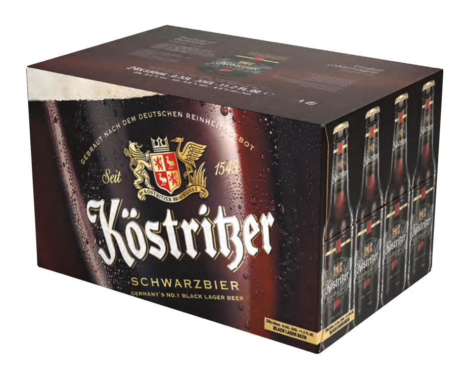
Köstritzer Schwarzbier 24 x 0.33 l bottle, carton