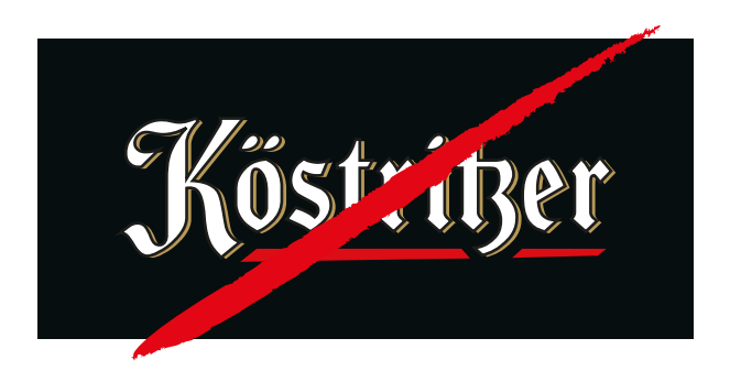
Old logo text with golden shadow