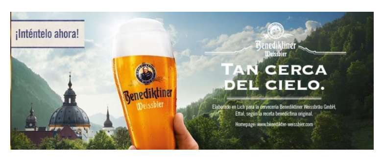
Web banner for Chile ✓ Call to action: "Try now"