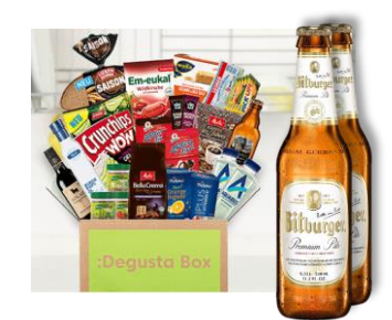
Bitburger sampling in Degusta Box for France