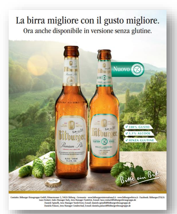
Image ad for Bitburger Pils and gluten-free version in Italian trade magazine

✓ Contact details of sales team and brewery