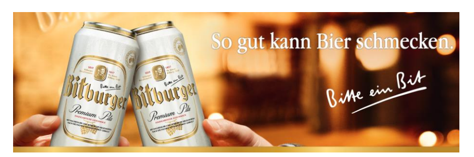
Banner for a retail chain in Denmark ✓ Clinking cans instead of glasses